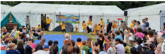
Spark in the Park, Welling