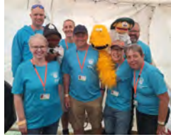
Lark in the Park, Sidcup

Over the summer the team was involved in Lark in the Park (Sidcup)